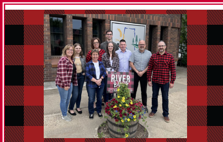
InVision helped paint the town plaid for the annual River Days Festival in July.